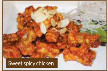
Sweet spicy chicken