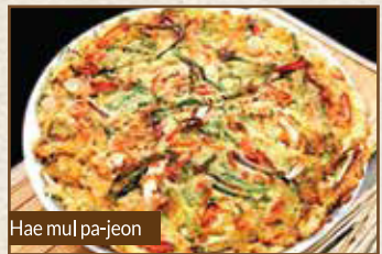
Hae mul pa-jeon