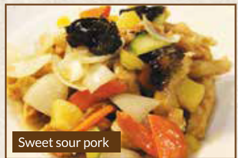
Sweet sour pork